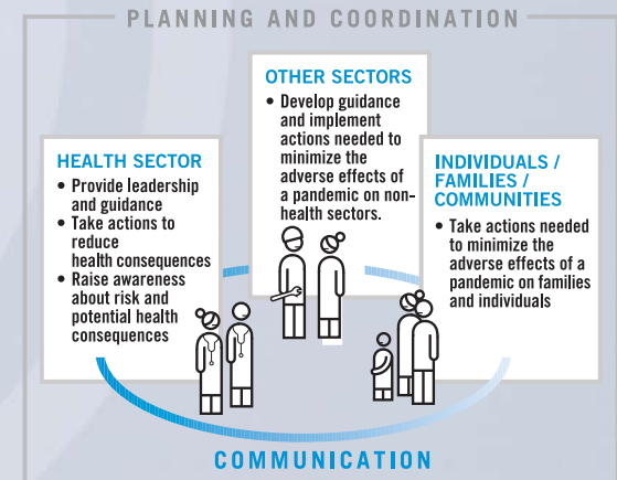
FIGURE 2 WHOLE OF SOCIETY APPROACH TO PANDEMIC PREPAREDNESS