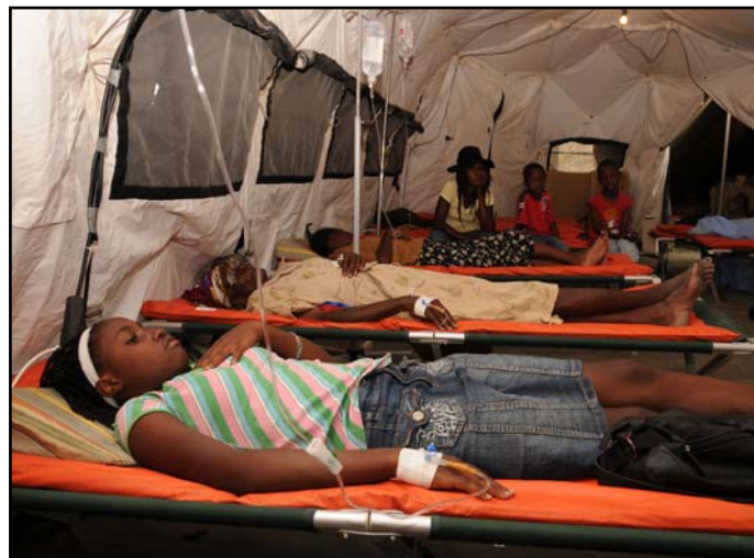
Patients receiving treatment in the Jordanian field hospital.