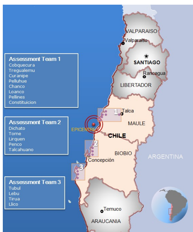
Map representing the areas where interagency assessment missions were carried out between 8 and 9 March.